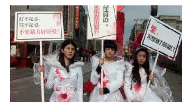
Blood-stained Wedding Gowns – Chinese Young Feminists Took to the Streets for the First Time on Valentine's Day 2012.