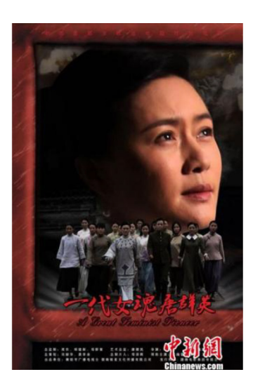
A great Feminist Pioneer (2019)